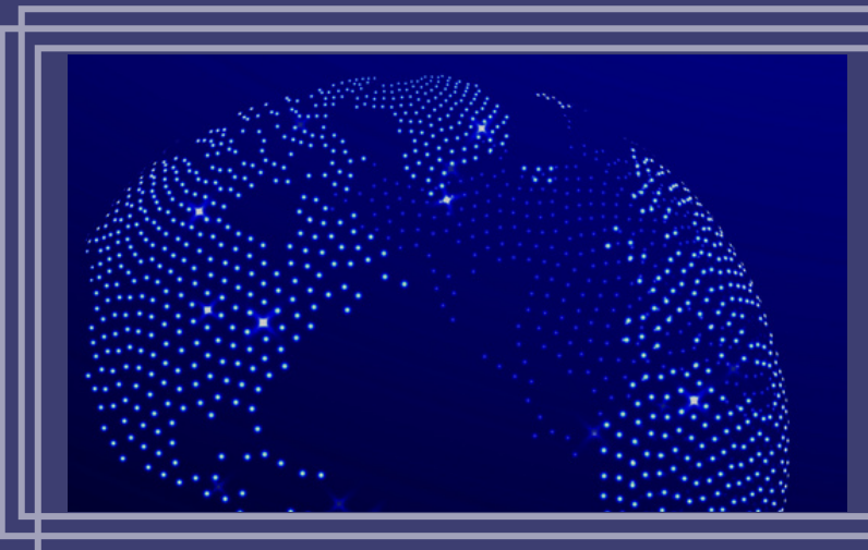
Growing local, becoming global